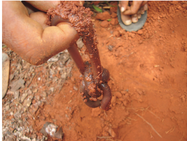
Fig 8. Giant earthworm just after capture.