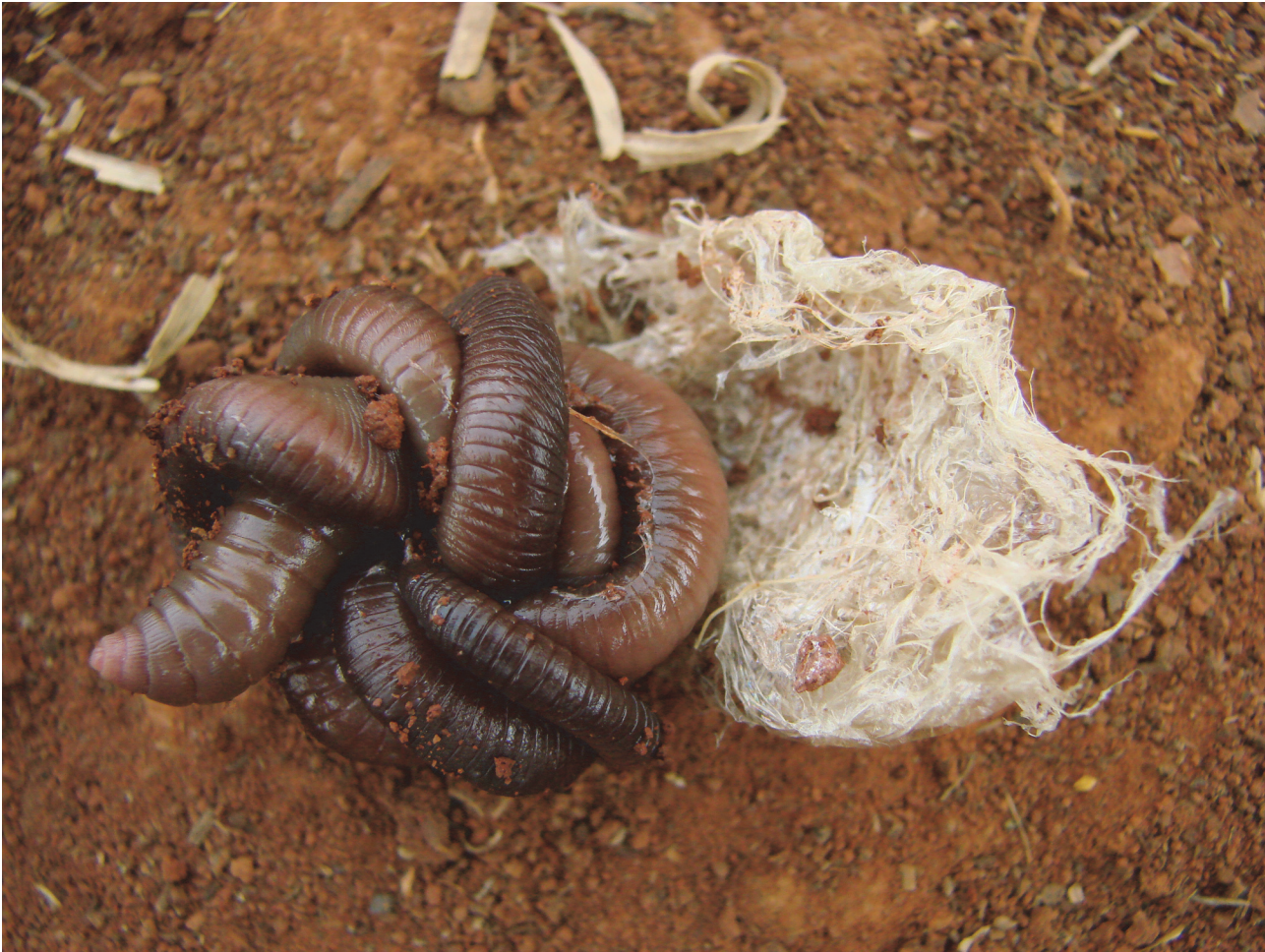
Fig 3. Rhinodrilus alatus and its “silk”. During the drier months, giant earthworms excrete mucus (“silk”, “wool”, “web” or “cloth”) that covers the bottom of the aestivation chamber which retains water and allows the worms to stay moist. The coiled worm has about 5 cm diameter.