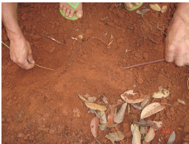
Fig 7. Extraction during the rainy season. Traditional extractor inserting a thin twig into the hole that is near the giant earthworm's head, which forces the animal to retreat.

extractor removes the litter and starts digging, clearing both openings of the gallery. The extractor then carefully inserts a thin twig into the hole that is near the giant earthworm's head, which forces the animal to retreat (Fig 7). This causes the caudal extremity to protrude out of