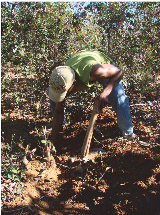
Fig 6. Extraction during the dry season. Traditional giant earthworm extractor using a hoe to excavation.