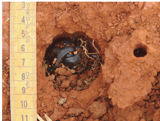
Fig 1. Rhinodrilus alatus in its aestivation chamber during the dry season.