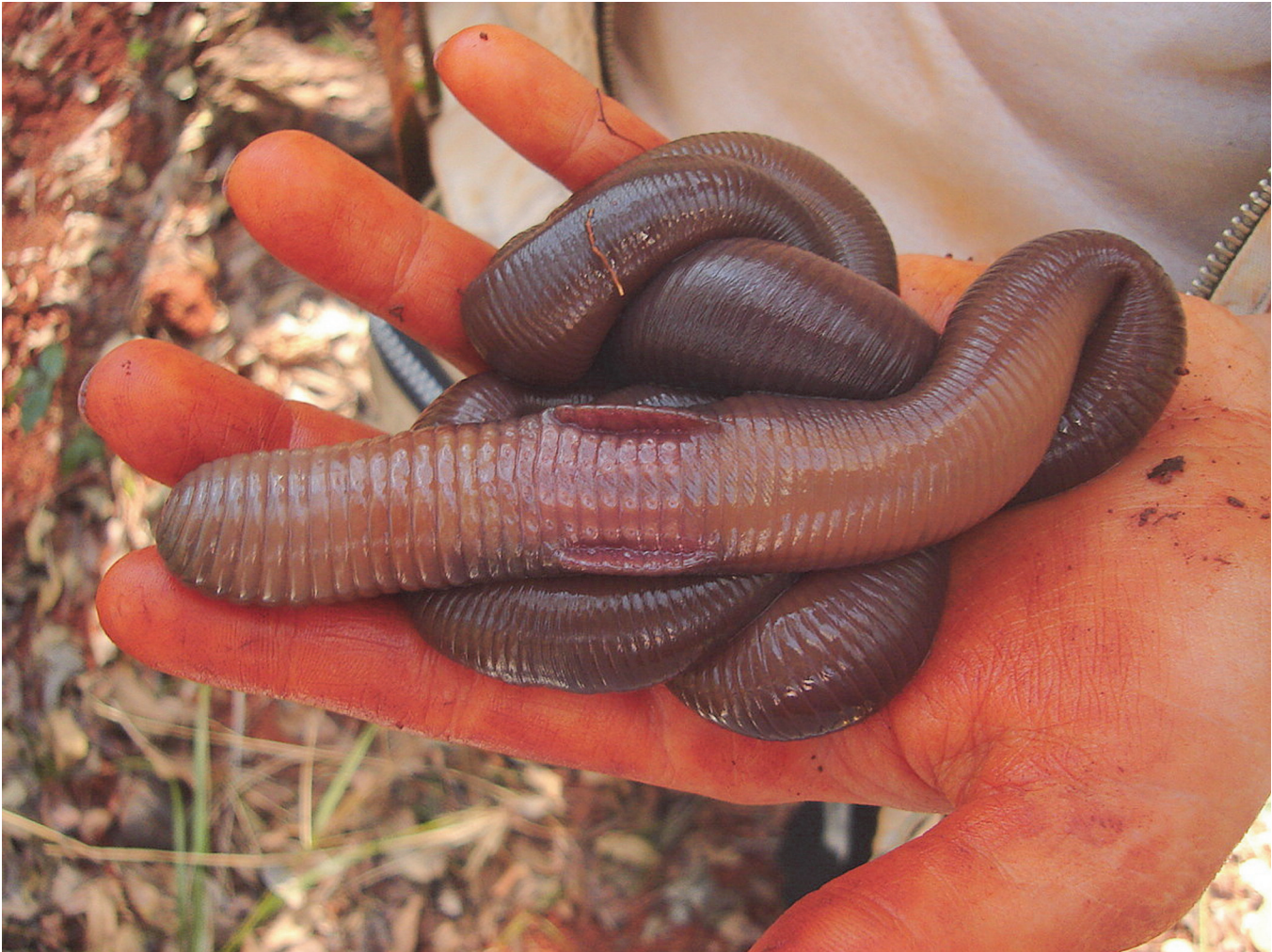
Fig 4. Mature specimens of Rhinodrilus alatus with laterally projected clitellum.